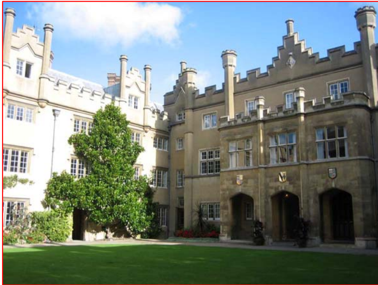
Hall Court, Sidney Sussex College